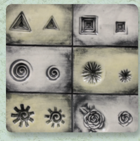
CD-1078: Press Tools 3, 6 Designs, 1.75"L x .875" Dia.