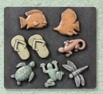
CD-916 Project, 8 Designs 2" each