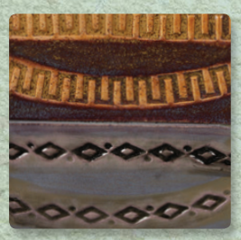
CD-1079: 2 Continuous Design 1"W

Easily roll an uninterrupted pattern into your clay.