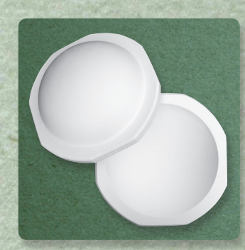
CD-852 Circle, 3" Dia. x 9.5"L