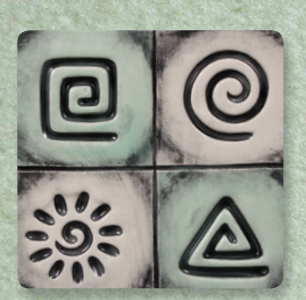
CD-1072: 4 Spiral Designs 1.5" Dia.