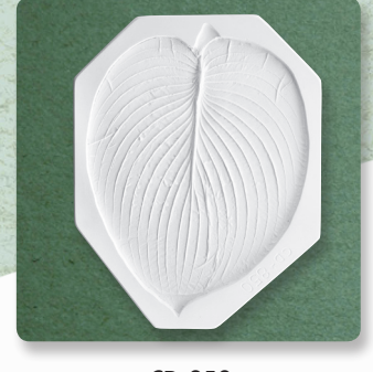
CD-850 Large Hosta Leaf, 14.25"L x 10.5"W