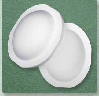
CD-777 Oval, 7.5"L x 7.5"W x 2"D