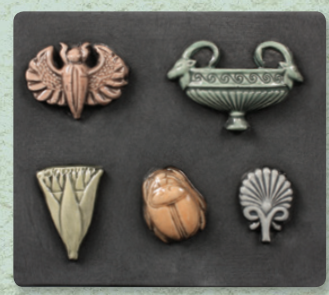
CD-1218 Egyptian, 5 Designs 1.5"L to 3"L