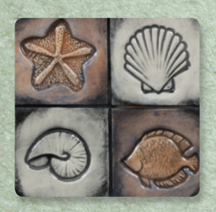
CD-1149: 4 Seaside Designs 1.75" Dia.