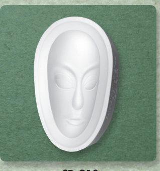
CD-913 Plain African Mask,9"H x 4.5"W