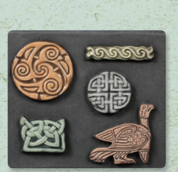
CD-1217 Celtic, 5 Designs 1.5"L to 2.5"L