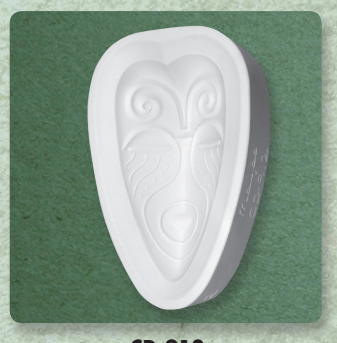
CD-912 African Mask (Heart), 9"H x 4.5"W