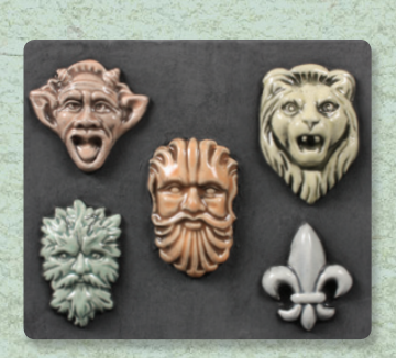
CD-1220 Gargoyles & Fleur-De-Lis, 5 Designs 2"L to 2.5"L