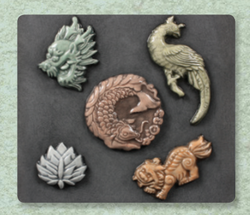
CD-1219 Chinese, 5 Designs 1.5"L to 4"L