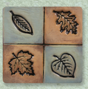
CD-1073: 4 Leaf Designs 1.75" Dia.