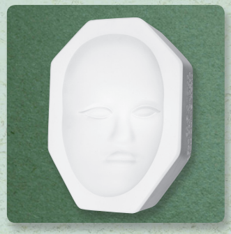
CD-879 Mask, 8.25"H x 5.75"W