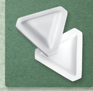
CD-775 Triangle, 1"H x 5" D