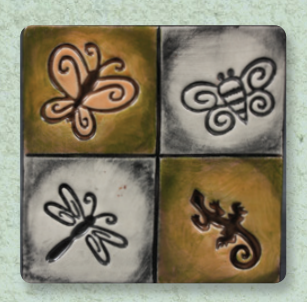
CD-1074: Dragonfly, Bee, Butterfly & Lizard, 1.75" Dia.