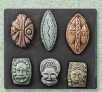
CD-1260 Masks & Shield African Theme, 6 Designs 2.125"L to 3.5"L