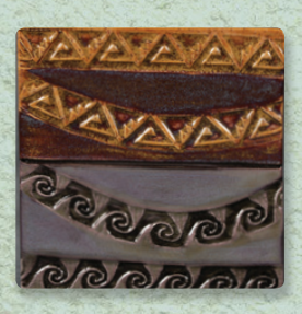
CD-1152: 2 Native American Continuous Design 1"W