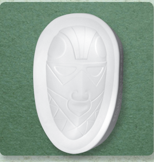
CD-911 African Mask (Oval), 9"H x 5"W