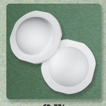
CD-776 Circle, 2.25"H x 5.75" Dia.