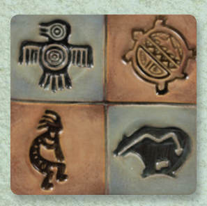
CD-1151: 4 Native American Designs 1.75" Dia.