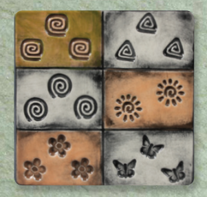
CD-780: Design Press Tools, 6 Designs, 1.75"L x .75" Dia.

Easily add pattern and design to surfaces with Mayco press molds. Smaller designs are perfect for stamping clay beads.