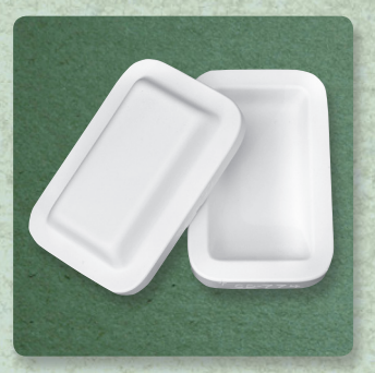
CD-774 Rectangle, 1"H x 7.5"L x 4"W