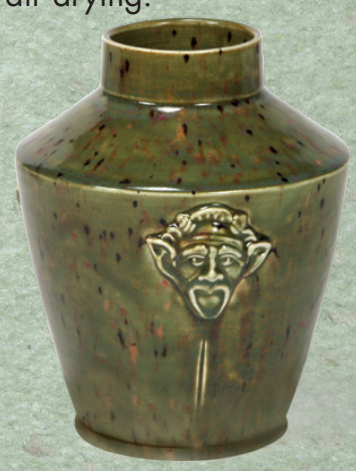
Features CD-1220 with Jungle Gems™ glaze CG94 Field & Flowers

Use sprig molds with clay requiring kiln firing or air drying.