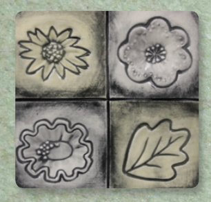
CD-1150: 4 Contemporary Flower Designs, 1.75" Dia.