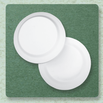
CD-914 Platter, 13" Dia.