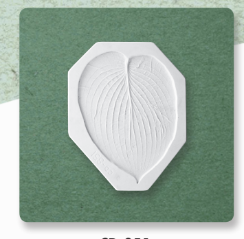
CD-851 Small Hosta Leaf, 11"L x 8"W