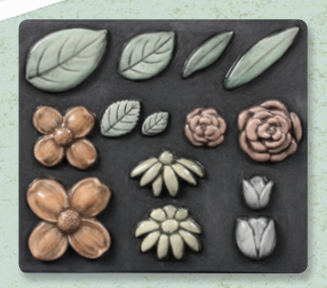
CD-778 Flowers & Leaves, 14 Designs .75"L to 2.5"L