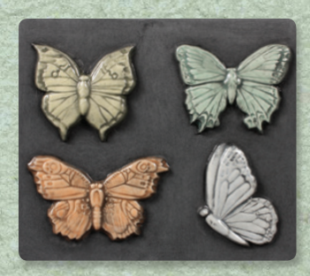
CD-1261 Butterflies, 4 Designs 2.125"L to 2.5"L