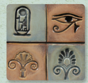
CD-1222: 4 Egyptian Designs 1.75" Dia.