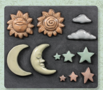
CD-779 Celestial, 12 Designs .5"L to 2.5"L