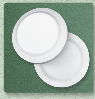
CD-915 Plate, 8" Dia.