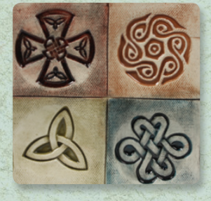
CD-1221: 4 Celtic Designs 1.75" Dia.